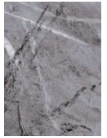
5073 Senza Fino