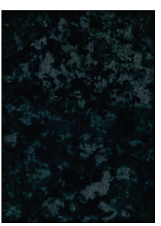
5062 Black Granito