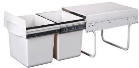
BIN218SCH – SOFT CLOSE 2 X 18LTR