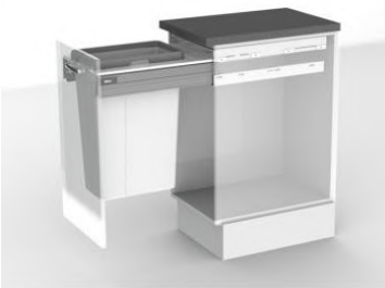
BINUB40035S – BIN FRAME SET 1 X 35LTR TO SUIT 400MM CABINET WIDTH 570H X 362 – 368W X 510D

DESIGNED TO EASILY FIT GRASS & NOBLE DRAWER SYSTEMS