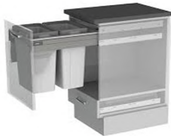
BINUB45021S – BIN FRAME SET 2 X 21LTR TO SUIT 450MM CABINET WIDTH 470H X 412-418W X 513D