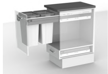
BINUB40018S – BIN FRAME SET 2 X 18LTR TO SUIT 400MM CABINET WIDTH 470H X 362-368W X 515D