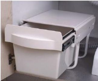
BIN115H – SOFT CLOSE SINGLE 15LTR