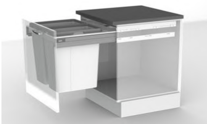
BINUB60035S – BIN FRAME SET 2 X 35LTR TO SUIT 600MM CABINET WIDTH 570H X 562-568W X 515D