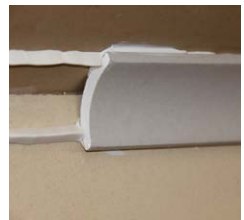
No more nails, screws, props, disasters and time... ritack makes installing cornices easy