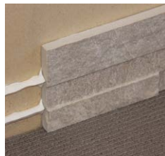
Place tiles in position then with a push you walk away - couldnt be easier!