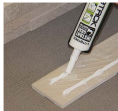
Applying ritack in stripes on tiles.