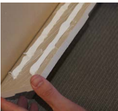
Tiling becomes a breeze with ritack.