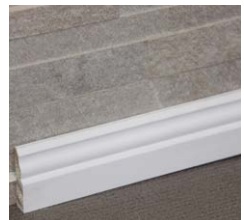
Making skirting boards easy to install