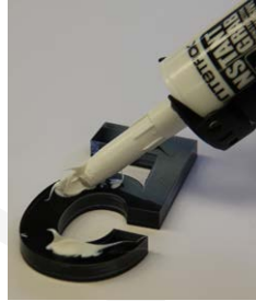
Apply the adhesive as required... beats drilling and screwing any day!