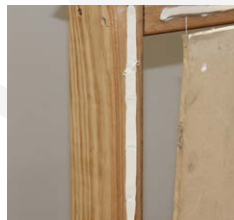
A bead of ritack on each upright and away you go!