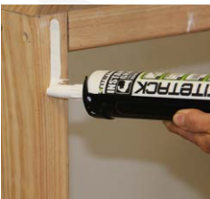
What makes installing fastwall faster than fast... you guessed it, Ritack!