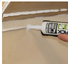
2 beads is all it takes!