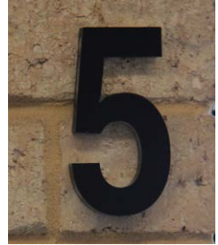
Place that sign or letter where you want it with confidence that where it will stay... no fixings needed!